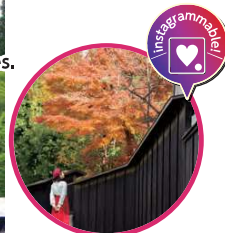
View fall colors, winter landscapes, and scenery unique to each season.