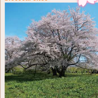
↑Peak season is around late April

Admire the beautiful golden-yellow leaves of the giant ginkgo tree