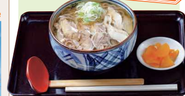
↑Cold Niku Soba ¥750 (with tax)

If you visit Yamagata, one thing you want to try is cold soba filled with the aroma of chicken stock.