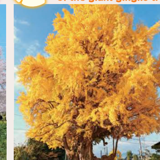
↑Giant tree, estimated to be 600 years old

Addr. Darumaji, Nakayama, Higashimurayama District Access Approx. 10 min by car from JR Uzen Nagasaki Station Car 30 vehicles